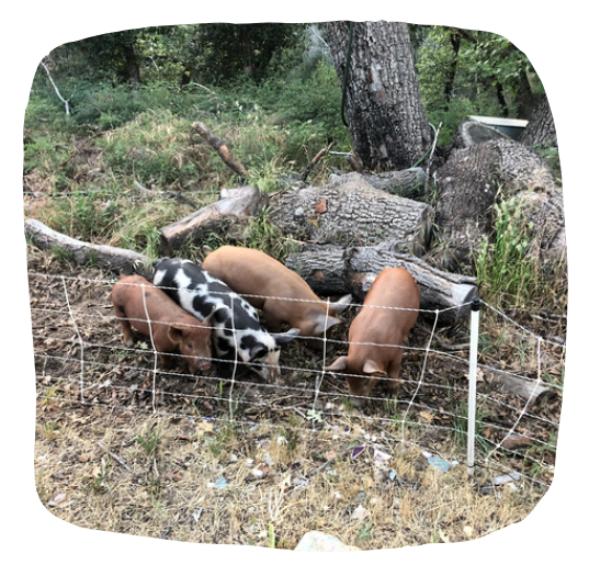
Left: Sharing the Eucharist at Camp Stevens. Above: Piggy friends at Camp Stevens.