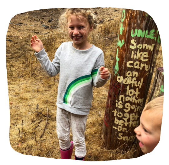
Above: Kids having fun with the Lorax Log at Camp Stevens.

Fear not: you do not walk this way alone! The CCC has the resources and enthusiasm to support and encourage teams that will multiply the good work we can all do together to take action in this climate emergency.